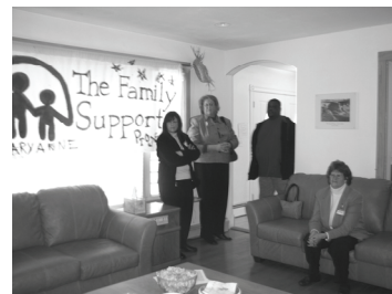
visitors in the living room of the youth center at the Family Support Project in Hyannis

Knowing that active exploration is a positive tool to ward off boredom and develop interests, frequent recreation and leisure activities occur both at the center and in the community of Cape Cod.