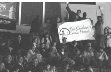
cheers to the AHL Springfield Falcons for hosting friends, families and students of the Study Home

On a mid March night over 100 people related to The Children's Study Home attended the Falcons' game and excitingly watched a very competitive game of hockey. This event was made possible through the generosity of the local hockey club. Friends came from as far as Boston and after watching the game, they commented it was well worth their trip.